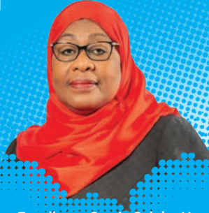
• Her Excellency Samia Suluhu Hassan President of the United Republic of Tanzania